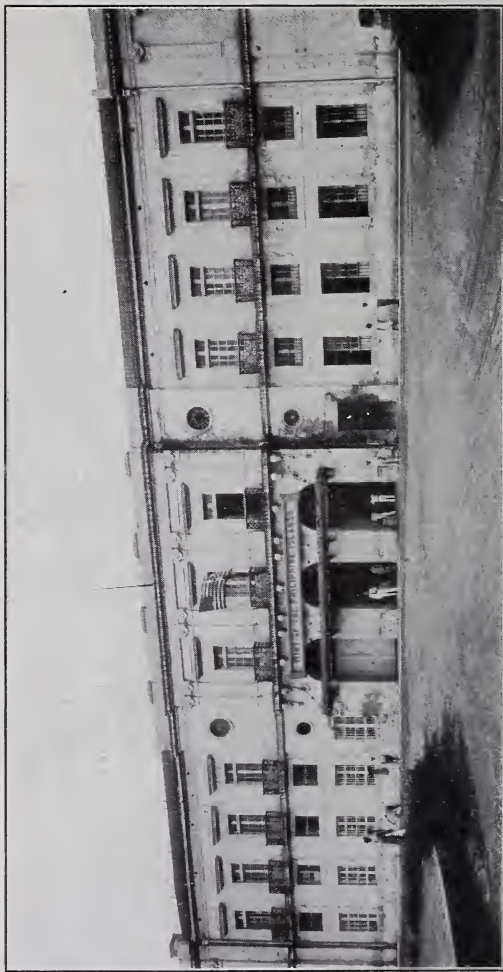
The Mint of the Philippine Islands in the Old Intendencia Building